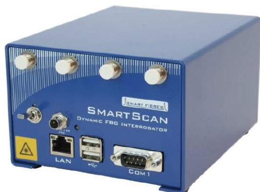
Commercial Grade SmartScan 04